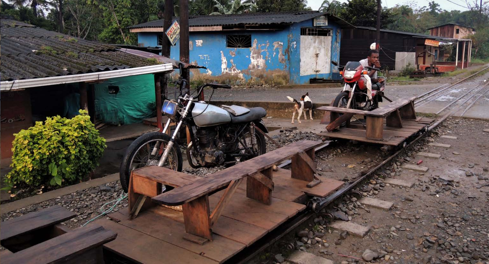
Brujitas in San Cipriano