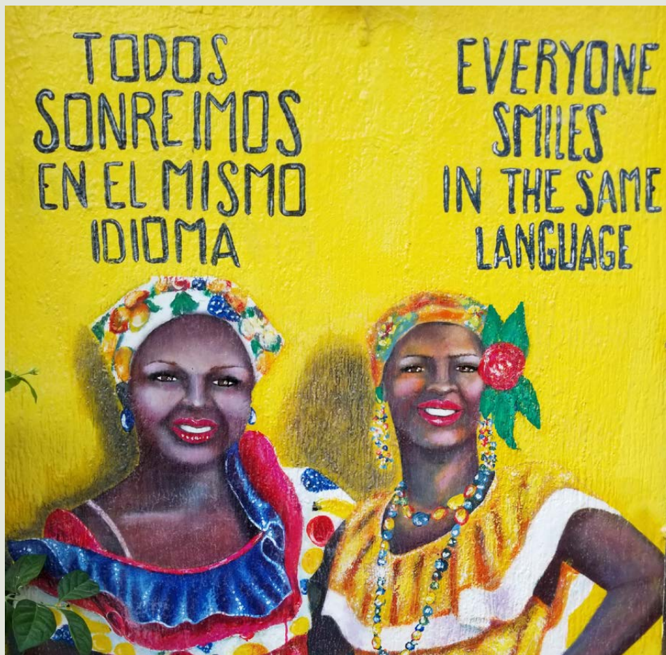
Street Art in Getsemani