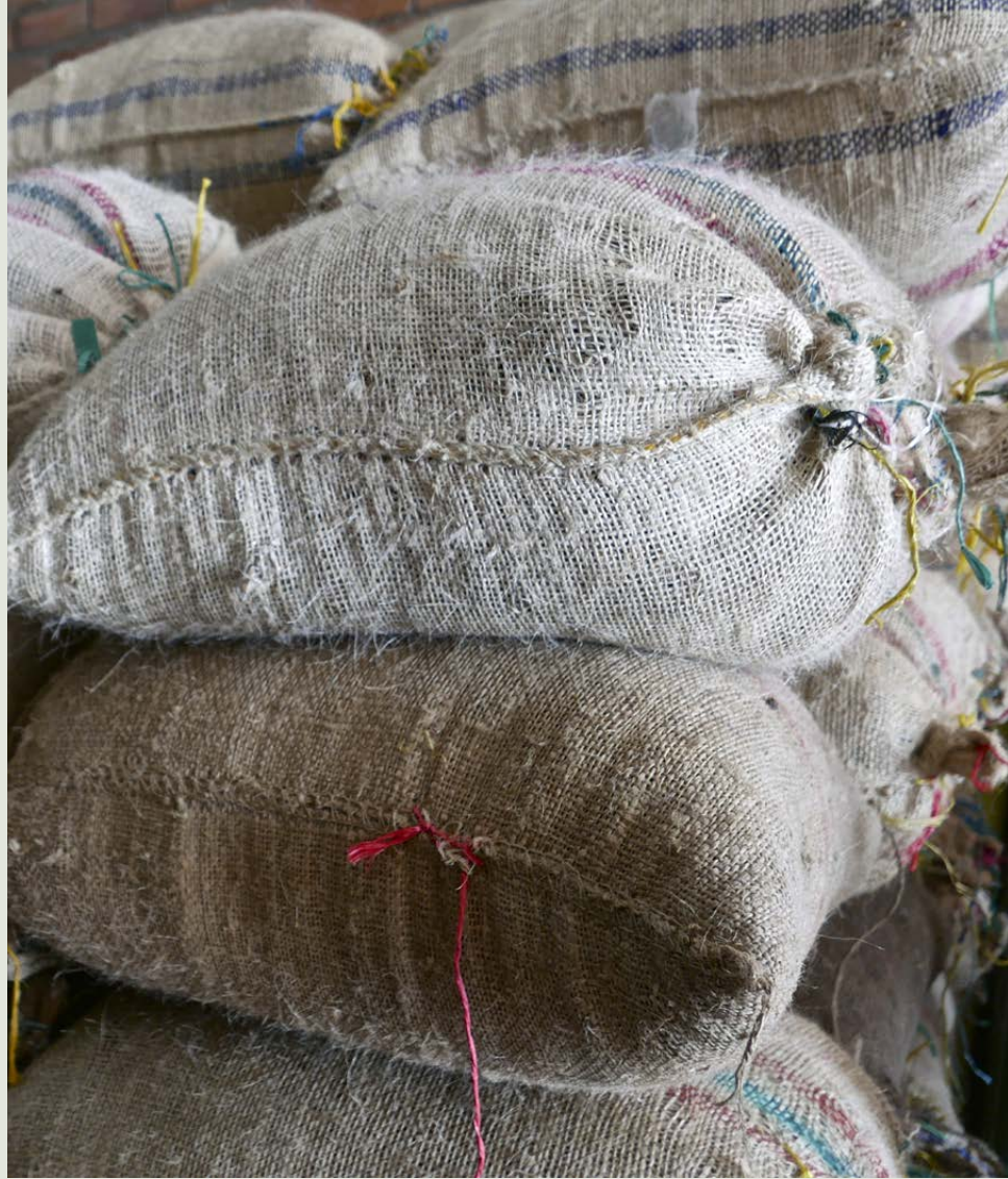
Cloud Forests and Coffee