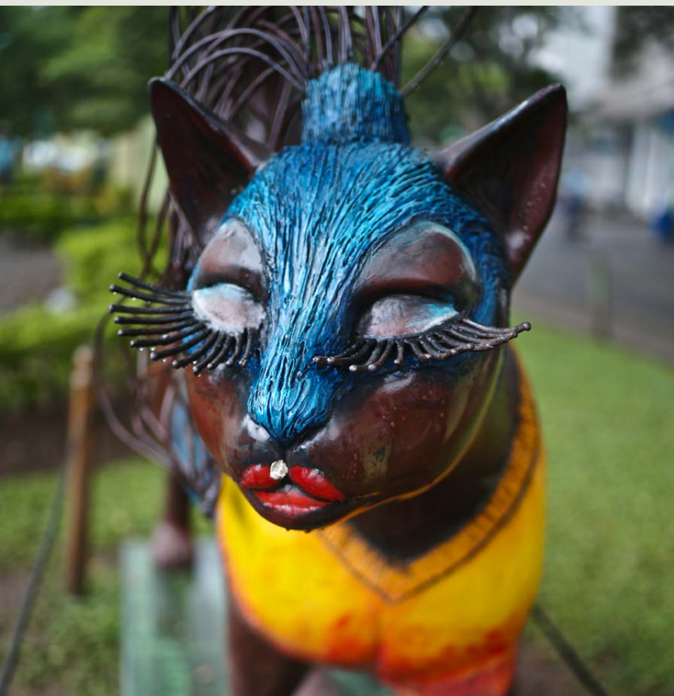
Cats of the River Kike Calvo