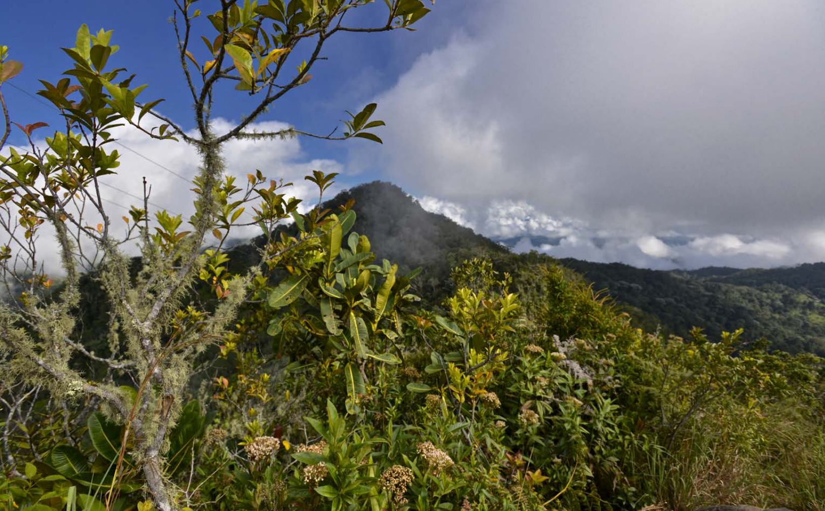
San Antonio Forest