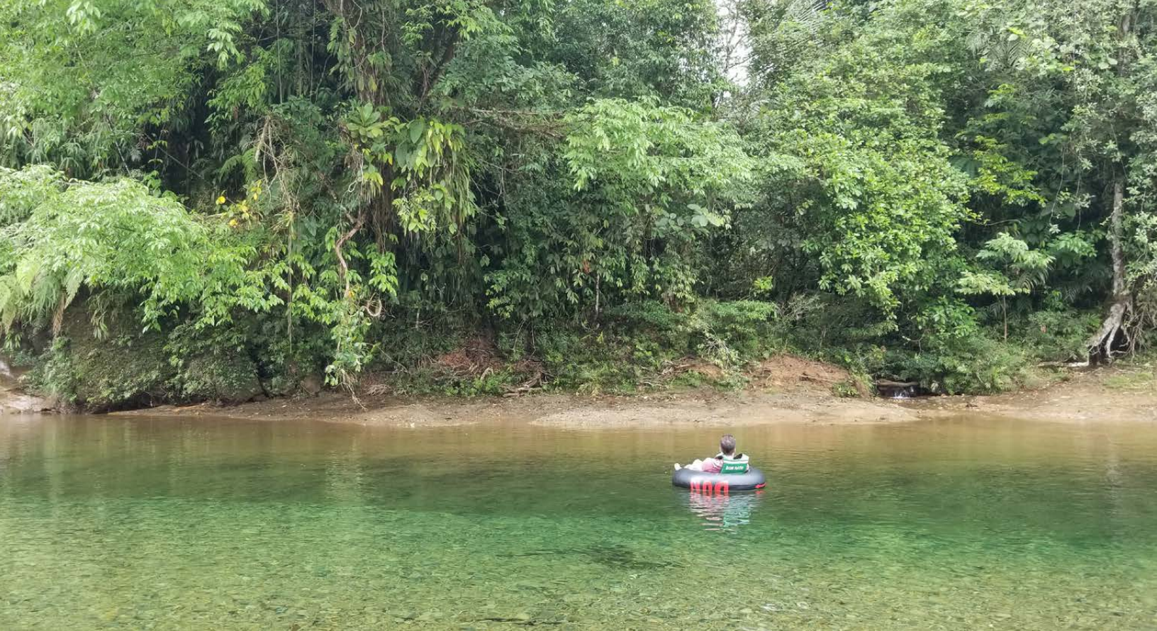
San Cipriano River Christopher Calonje